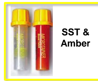
SST & Amber